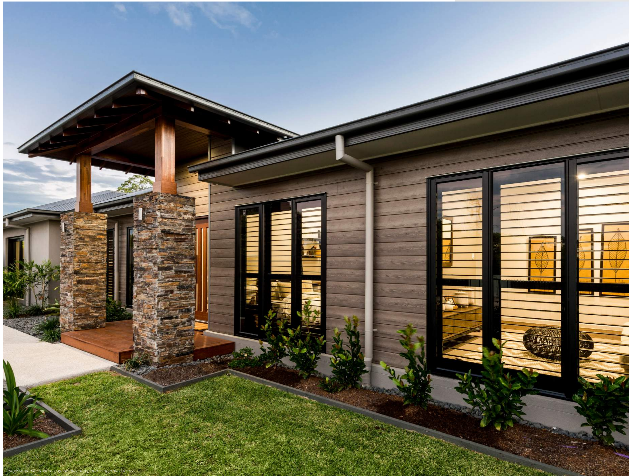
Image should be used as a guide only and features upgraded items.

Architecturally styled aluminum powdercoated windows (with aluminum barrier screens upstairs where required) for a polished look and easy maintenance.