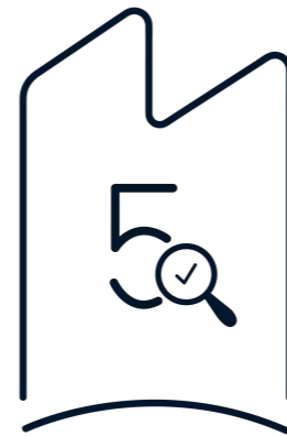
QUALITY BUILD INSPECTIONS