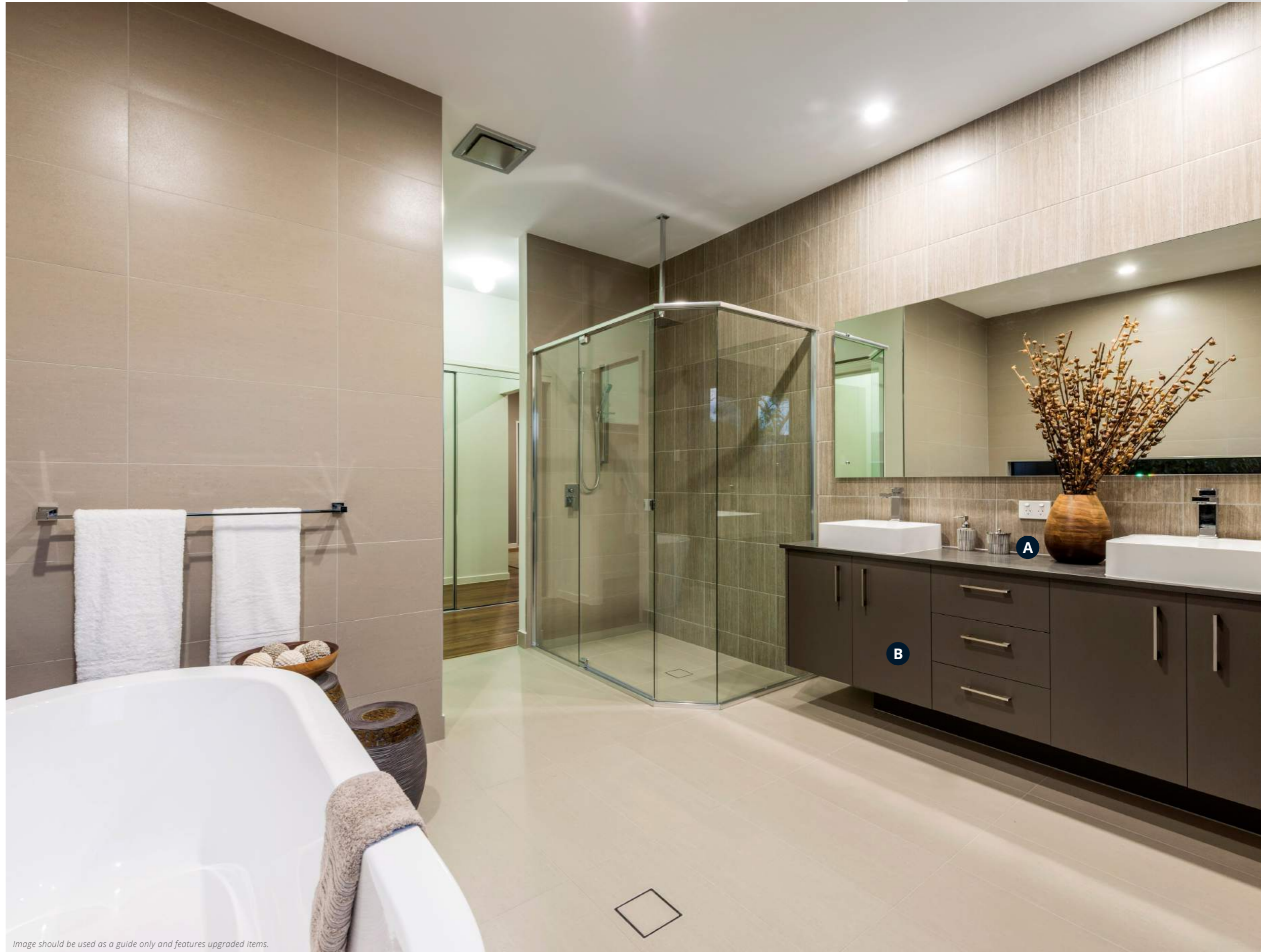
Image should be used as a guide only and features upgraded items.

Add character to your Ensuite, Bathroom and Laundry with your choice of ceramic tiles from an extensive range of colours at Beaumont Tiles.