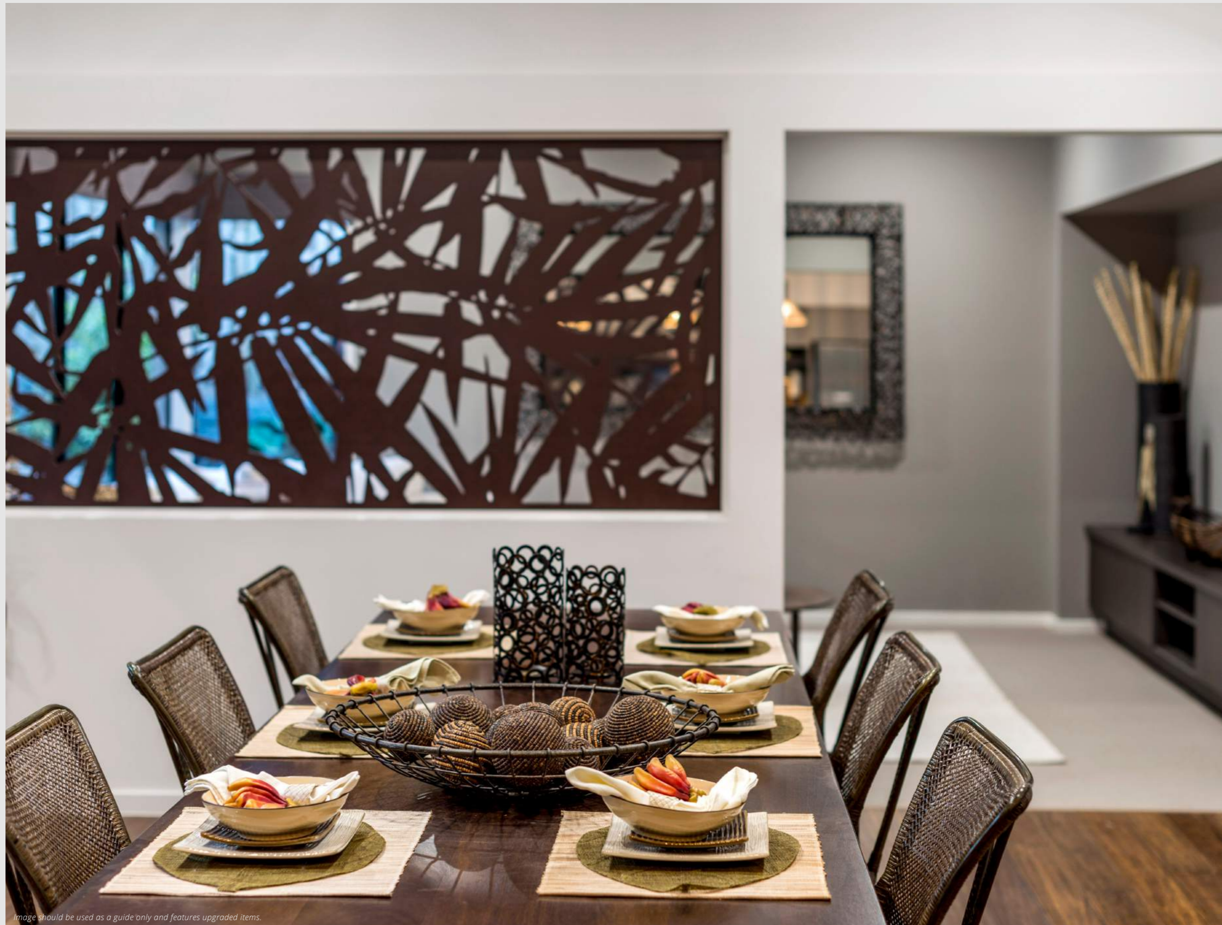
Image should be used as a guide only and features upgraded items.

R1.5 Wall Batts to External Lightweight Cladded Walls (Excluding External Walls with Brickwork Cladding).